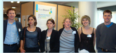
ShareBiotech partners in Gen2Bio