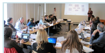
ShareBiotech consortium in Nantes

Partners met in Rennes, France on the 27th and 28th of November 2011 and in Nantes, France, on the 25th and 26th of April 2012 to define mechanisms to improve technology service offer in ShareBiotech regions and "instruments to foster technology transfer". In this context the audit results of selected Technological Core Facilities (TCF) in the partners region were presented and actions to support TCF professionalization considered.